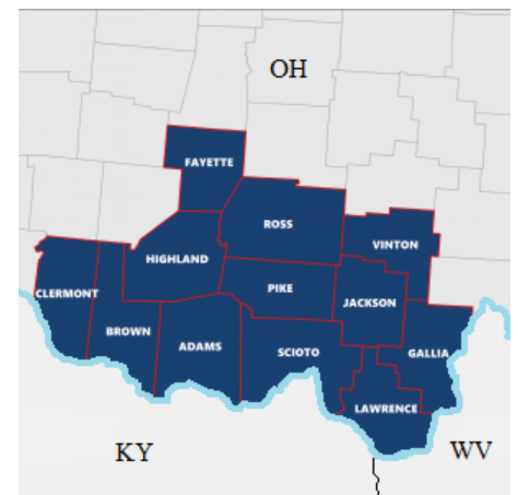
The OVRDC Region

Develop a report, create a website, conduct webinars, and disseminate the findings from this study and develop a best practices white paper to share with the EDA and Appalachian Regional Commission (ARC) network