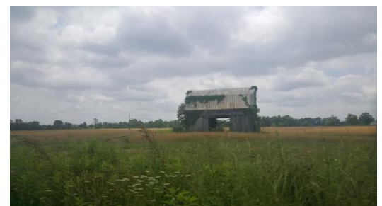
Site for potential industrial park in Adams County off of SR-32

Identify the "social determinants" of economic development (education, workforce, health, etc.) in Adams County and determine the ability of private sector social enterprises to deliver traditionally public services, mitigate the loss of tax revenue, and advance economic development strategies